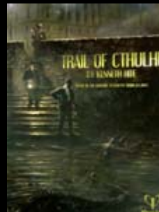
TRAIL OF CTHULHU