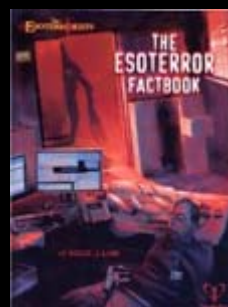
THE ESOTERROR FACTBOOK