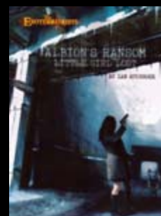
LITTLE GIRL LOST